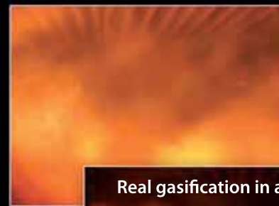
Real gasification in action

85% efficiency versus 45% for a conventional wood evaporator.